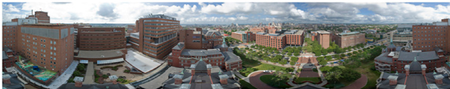
Johns Hopkins Medical Institutions