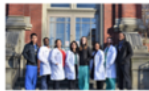
SENSE OF BELONGING, VALUE AND RESPECT