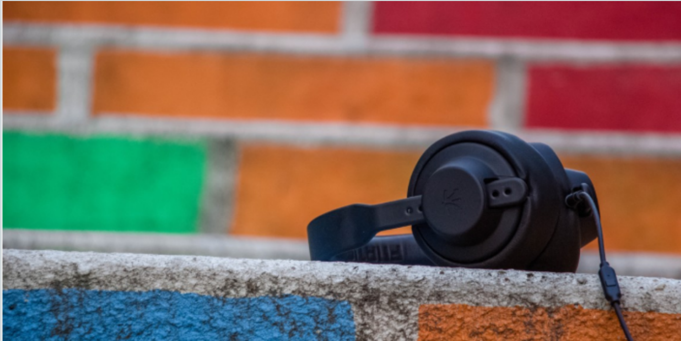
Portraits of Stanford Medicine: Three new podcasts on diversity

Check out three podcasts on diversity from Portraits of Stanford Medicine.