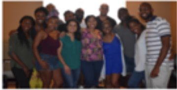
COMMUNITY, TRUST AND FRIENDSHIP