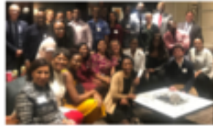
POSITIONS OF POWER