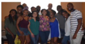
COMMUNITY, TRUST AND FRIENDSHIP