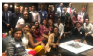
POSITIONS OF POWER