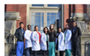
SENSE OF BELONGING, VALUE AND RESPECT