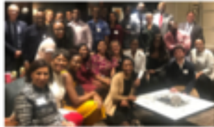
POSITIONS OF POWER